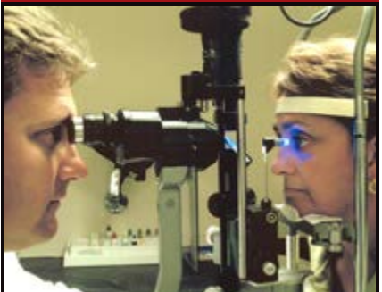
Women and their ophthalmologists need to be aware of hormonal risk factors for development of glaucoma.

utes to increased susceptibility of the optic nerve to glaucomatous damage and that estrogen may provide a protective effect against glaucoma.