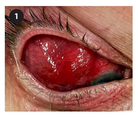
CLINICAL VIEW. Preoperative appearance of chemotic hemorrhagic tissue over the Ahmed plate.

Early improvement. When she returned for follow-up the next day, Ms. Jones reported improvement in