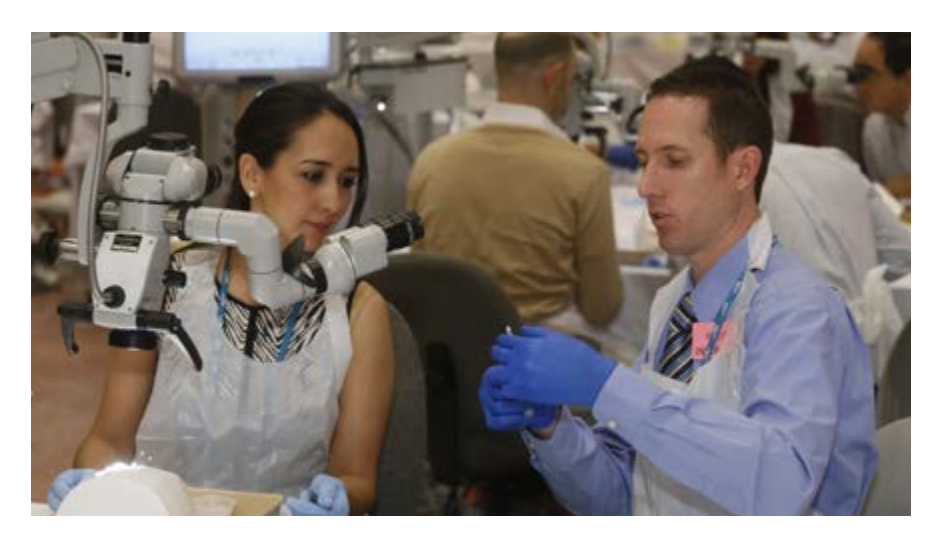
DISCOVER NEW TECHNIQUES. Skills Transfer labs allow you to learn innovative skills from leaders in the field in a hands-on learning environment.

building your AAO 2016 schedule at www.aao.org/programsearch.