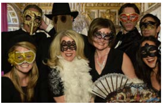
JOIN THE FUN. Over the last 12 years, the Orbital Gala has raised more than $1.8 million in support of the Academy's programs.