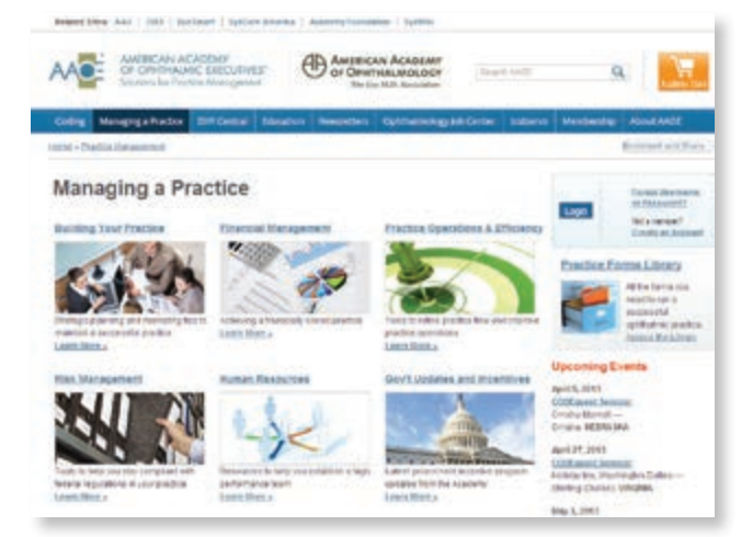
UPDATED SITE. The redesigned website <u>www.aao.org/aaoe</u> is a valuable tool for finding and utilizing practice management information, programs, products, and services designed to address the needs of ophthalmic administrators, office managers, managing physicians, billers, coders, and others.

• A primer on effective online reputation management. If an ophthalmologist's practice has few online reviews, it is at increased risk of having a low rating; a higher volume of reviews correlates to a higher average rating. How do you get those reviews, and where should they be placed? AAOE's article "Protect Your Online Reputation and Grow Your Patient Base" will answer