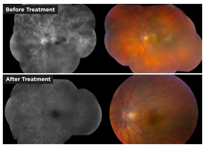
BEHÇET. This 30-year-old patient had macular retinitis and vasculitis (top images). He responded favorably to infliximab infusions, and resolution of both his retinitis and vascular leakage was noted (bottom images).