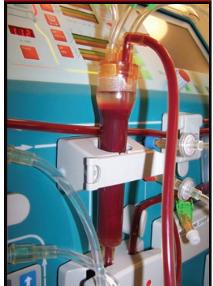
A venous bubble trap on a hemodialysis monitor.

Who is at risk? Patients who don’t have glaucoma, or those who do but are well-controlled with medication or filtering surgery, can accommodate the fluid buildup, said Dr. Asrani. But an eye with a compromised outflow system cannot. “When the fluid shifts, you get increased fluid overflow in the eye that overwhelms the outflow system,” he said. This causes the pressure to rise.