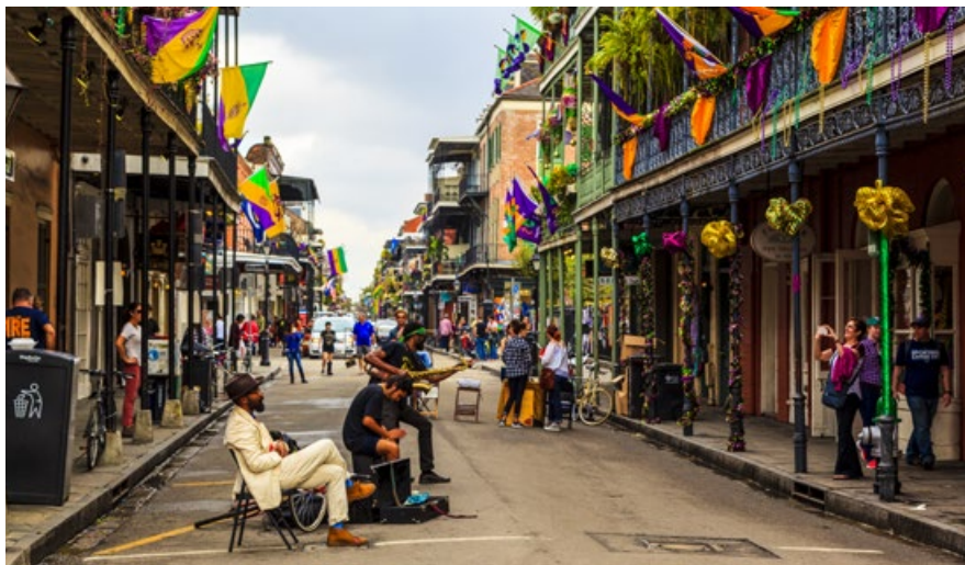
GET READY FOR NEW ORLEANS. Engage with colleagues from around the world, learn new skills, and hear about the latest and most innovative treatments.

For more information, visit aao.org/registration .