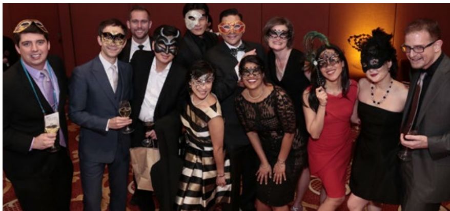
"LAISSEZ LES BON TEMPS ROULER." Don't miss the Orbital Gala at AAO 2017.

"Evidence-based medicine will still be the backbone that the speakers will use to decide if it is time for comprehensive ophthalmologists and subspecialists to change their ways on a wide variety of topics, from infectious and inflammatory disorders to ocular