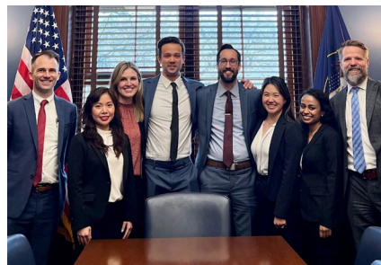
CONGRESSIONAL ADVOCACY DAY. The Utah contingent gathers on the Hill during Congressional Advocacy Day 2022.

I've attended Mid-Year Forum four times during training. It was not easy and required careful scheduling of studying, call, vacations, clinic and surgery, and life outside of work. I found myself on late flights and twilight drives, but always more energized on returning home than when I left.