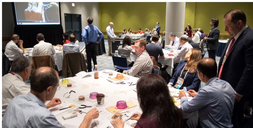
HANDS-ON LEARNING. Attendees learn about maneuvers and surgical techniques for scleral fixation or iris fixation of posterior chamber IOLs using sutures.