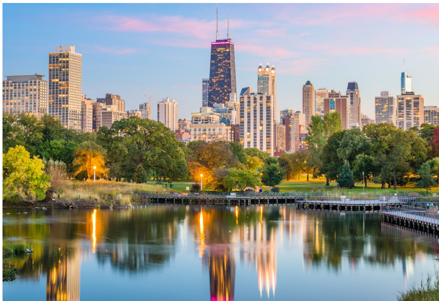
AAO 2024. This year's annual meeting will be held in Chicago from Friday, Oct. 18, through Monday, Oct. 21.

Make the most of your time in Chicago by taking advantage of some of the unique activities available in the Windy City. Be sure to secure tickets and reservations well in advance of the meeting.