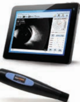
The DGH 8000 SCANMATE Portable USB B-Scan

Serving Eye Care Professionals Since 1982