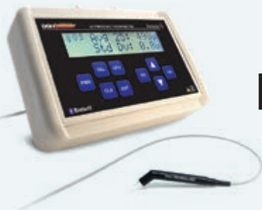
The New PACHETTE 4

VISIT US AT AAO BOOTH #2500 FOR SHOW SPECIALS