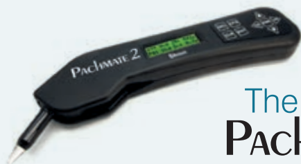
The New PACHMATE 2