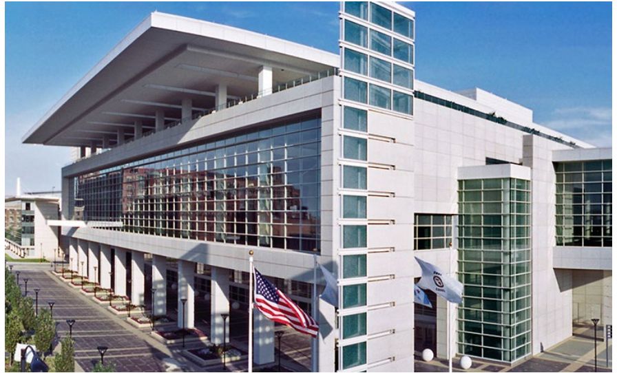
MCCORMICK PLACE. AAO 2022 will take place Sept. 30 through Oct. 3 at McCormick Place in Chicago. The convention center has achieved GBAC STAR Facilities Accreditation for cleaning, disinfection, and infectious disease prevention practices.

For Academy and AAOE members, registration and ticket sales open on June 15, as does the hotel reservation system. Nonmembers can register and book a hotel room starting June 29.