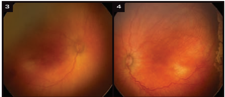
AFTER. The effects of treatment 1 week after bevacizumab (3) and 2 weeks after laser (4).

Pro: Less trauma, faster response. Anti-VEGF injections are easier on the babies, said Dr. Quinn. “They can be done under topical, don’t require much sedation, if any, and take minutes instead of 30 to 40 minutes per eye to perform,” he said. “They also have an amazingly fast response—within 3 to 4 days—faster than what you see with laser.”