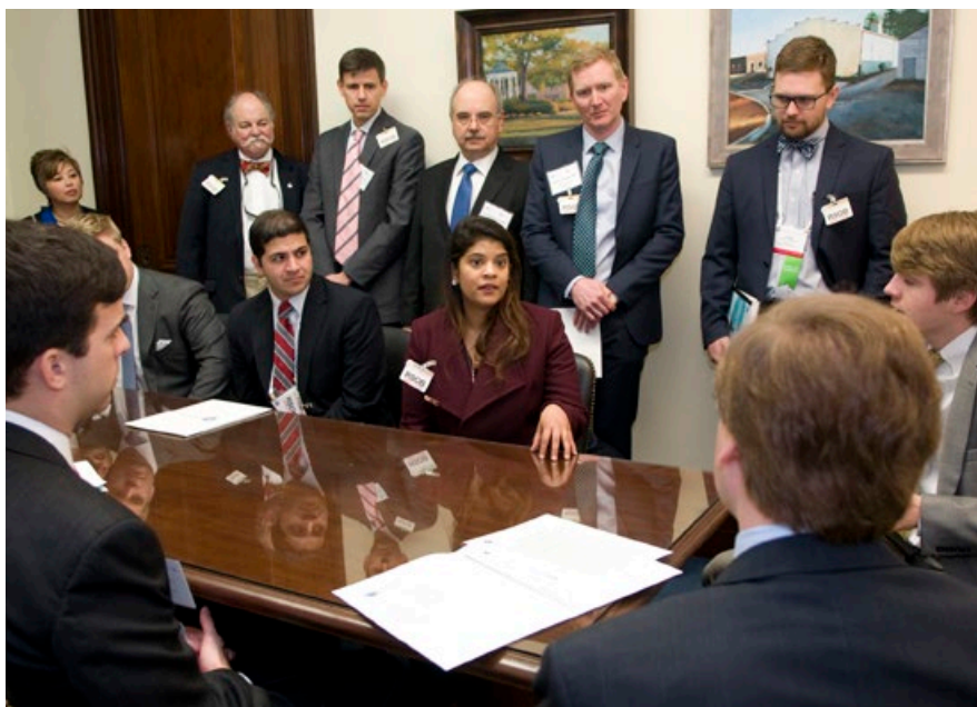
ADVOCATE. Academy members volunteered to advocate to senators on ophthalmic issues during Congressional Advocacy Day 2018.

Until now, the Academy's 38,000-piece Museum of Vision collection has been accessible only by appointment or online. With your support, the Acad-