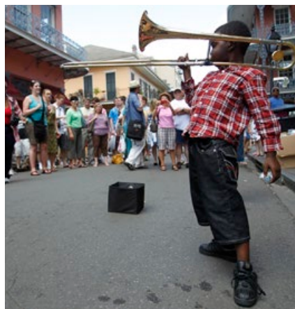
NEW ORLEANS. AAO 2021 will take place Nov. 12-15 at the Ernest N. Morial Convention Center in New Orleans.

session to Friday, Nov. 12, 5:00-6:30 p.m. for an inspirational start to the meeting.