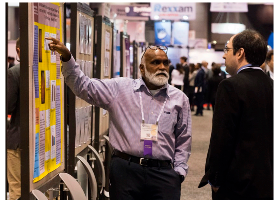
ATTEND A POSTER DISCUSSION. These moderated discussions are free with AAO 2017 registration.

The Academy is accredited by the Accreditation Council for Continuing Medical Education (ACCME) to provide continuing medical education (CME) for physicians. The Academy designates this live activity for a maxi-