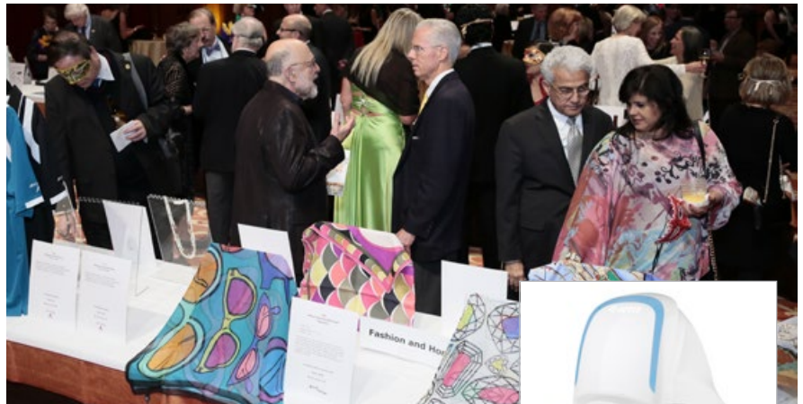
BID ON THE OPTOS CALIFORNIA. This device allows you to capture 200 degrees (or up to 82%) of the retina in a single image.