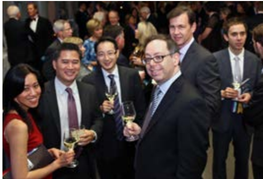
RAISE A GLASS. Have a cocktail, indulge in culinary delights, get great deals on silent auction items, and dance to live music at the Orbital Gala.

This year will see an even more robust lineup of programs on Saturday, Oct. 18. Be sure to check out the latest de-