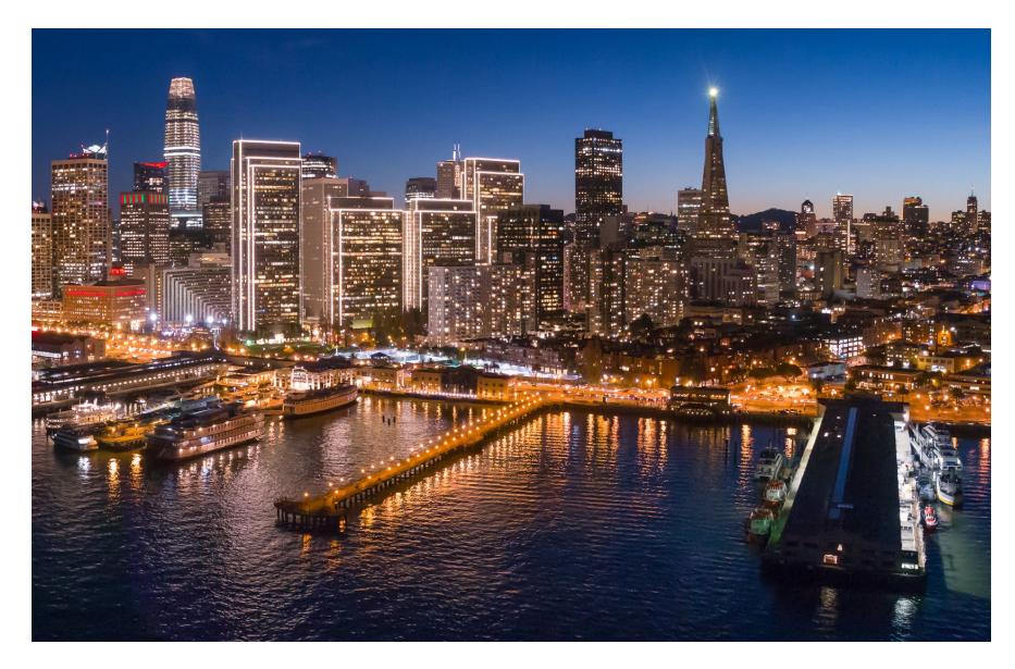
AAO 2023. This year's annual meeting will be held in San Francisco from Friday, Nov. 3, through Monday, Nov. 6.

restaurants. Stroll through the Ferry Building to admire the abundance of produce grown and treats made in the area. Check out Eater SF's list of the "38 Essential Restaurants in San Francisco."