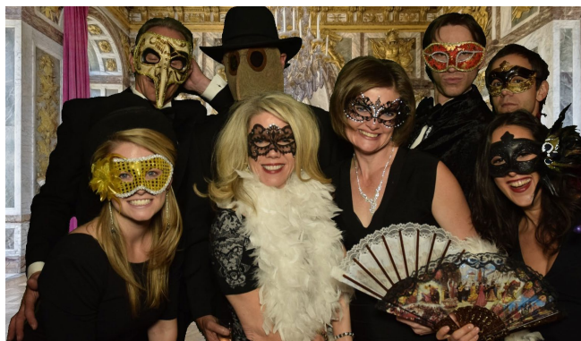
ORBITAL GALA 2021. The Foundation's 18th annual fundraiser supports the Academy's vital educational, public service, and quality-of-care programs.

Academy offerings. Be sure to visit the Academy Resource Center (Hall G, Booth 4039) to find experts and