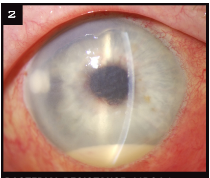
BACTERIAL RESISTANCE. MRSA keratitis with hypopyon in a health care worker after sutureless cataract surgery.